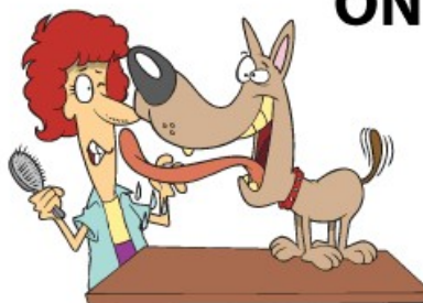
The dog is on the table. The woman has dog saliva on her.