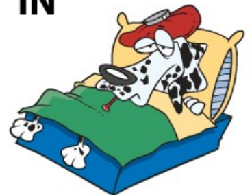
The dog is in the bed. There is a thermometer in its mouth.