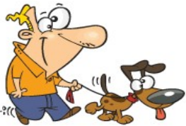
The dog is in front of the man.