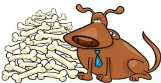
The dog is next to the bones.