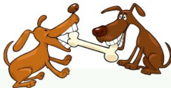
The bone is between the two dogs.