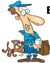
The dog is behind the postman.